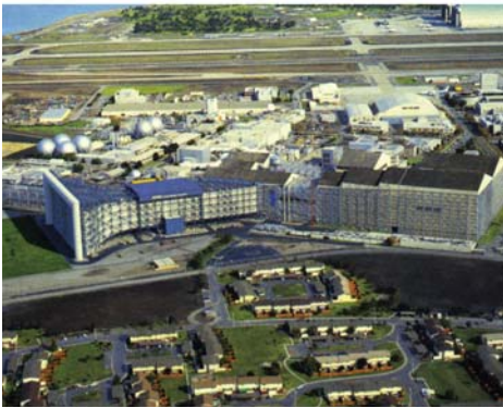
Aerial of windtunnels.